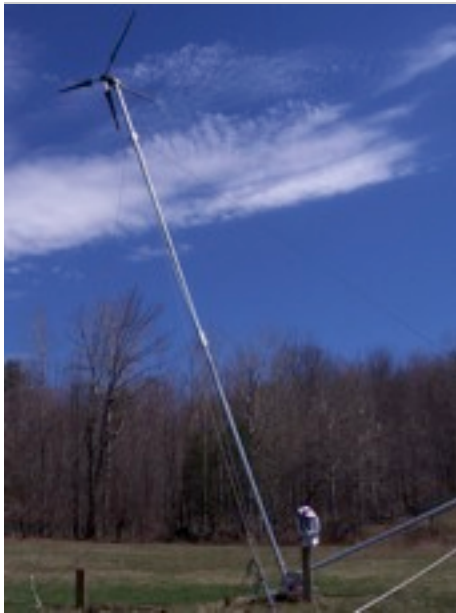
Raising the turbine (N1FMP)

We now have running a 1 kW Whisper 200 wind generator on a 30' tower and a 1.3 kW PV array. They feed a pair of OutBack 3 kW "off grid" inverters and store energy in a 26 kWh (48 v) battery bank.