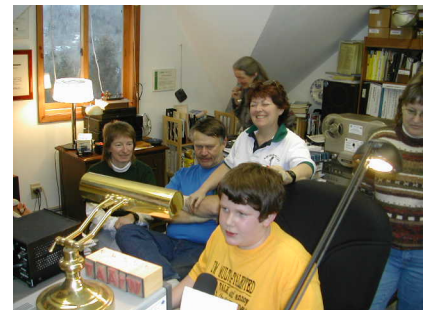
Last year's QSO Party

CW/Phone/Digital, sponsored by the Central Vermont Amateur Radio Club from 0000Z Feb 3 (7 pm EST Fri. 2 Feb) to 2400Z Feb 5 (7 pm EST Sun. 4 Feb). Frequencies (MHz): 160-10 meters and VHF/UHF; CW 40 kHz from band edge (20 kHz Novice/Tech segments), Phone -- lowest 25 kHz of General segment and entire Novice/Tech 10 meter band, VHF SSB-50.200, 144.200, FM-146.49, 146.55. Categories: SOAB (Single Operator All Band, MO (Multiple Operator-Multi Transmitters, Club and Rover. Exchange RST and VT county or State/Province/Country. QSO points: Phone = 1 pt, CW or digital = 2 pts. Work stations once per mode up to four QSOs per band. Score: QSO points times VT/NH/ME counties plus Vermont Club Stations. VT stations only add S/P/C, each counted only once. For more information and list of club stations: qsl.net/w1bd . Logs due Mar 1 to trlong1@adelphia.net for transfer to the Vermont QSO Party Coordinator or mail, Central Vermont Amateur Radio Club, PO Box 74, South Barre, VT 05670-0074.