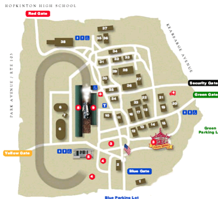
The site of HossTraders

19-Aug, 8:00 AM to 3:00 PM (LT), Highgate Shopping Plaza, St. Albans, VT. [I-89 to Exit 20, to Rt. 7 South, Plaza on your left]