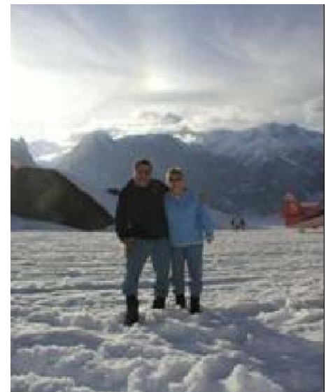
Summertime and Mt McKinley